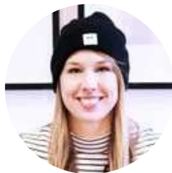
An article by Vera

With this DIY key board the search is finally over and your keys are not only practical but also nicely stored.