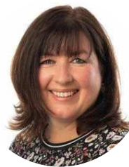
An article by Claudia

The best thing about it is that you design it yourself. But you don't have to be a calligrapher or a lettering artist: all you need to do is follow these step-by-step instructions.