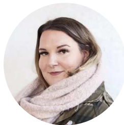
An article by Jani

You don't always have to buy postcards - with a bit of creativity you can produce your very own, personalised ones. A home-made postcard is a simple way of giving those you love a nice surprise. Whether you send it from your holiday, for a birthday, or just because - it's a lovely way of telling them you're thinking of them.